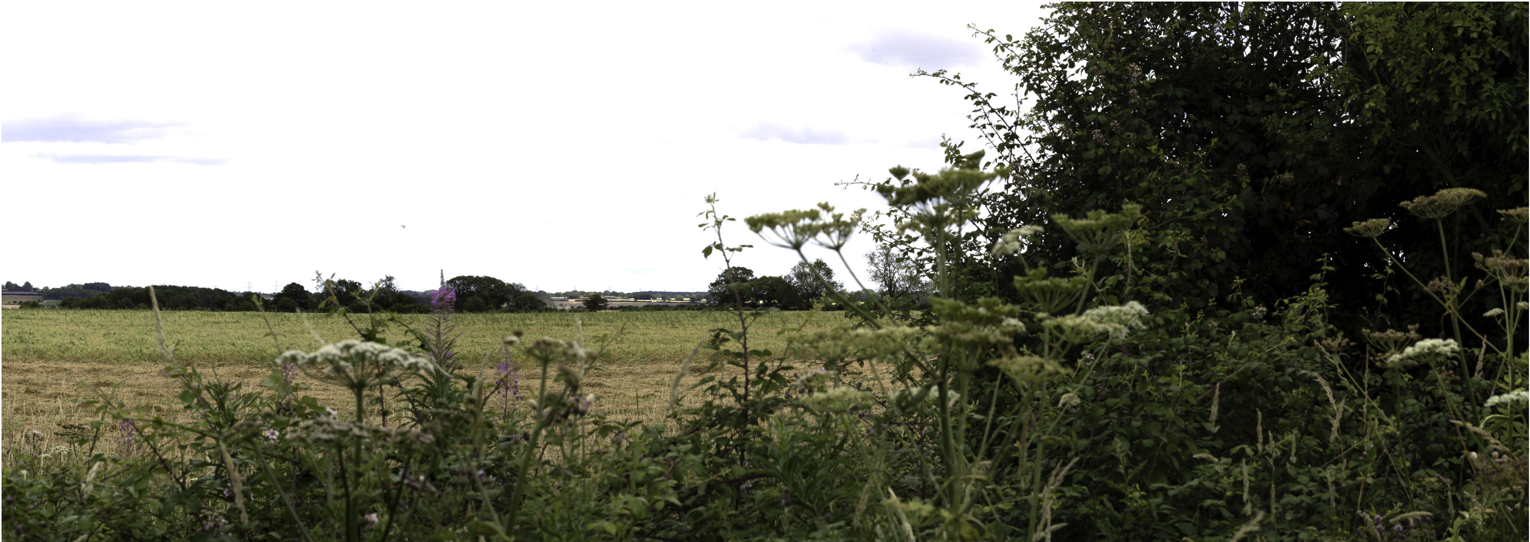
Representative Viewpoint 3 (looking east) - Petticoat Drove and PRow South Acre RB1

Existing View – This view is representative of PRow users along topographic high points of Petticoat Drove (South Acre RB1). This view is from a gap in the hedgerow, which is generally visually well enclosed by mature hedgerow and hedgerow trees. There are long distance views out north-eastwards, with views comprising woodland and existing overhead transmission lines that punctuate the skyline. The agricultural fields are visible in the foreground, with aligning vegetation also visible to the north as topography slopes away from the field of the view. All assessment was undertaken in winter to consider the worst case scenario given that potential effects are likely to be greatest during winter months. During the summer months, potential views into the Site, and of the Scheme, are likely to either be reduced or the same when compared to winter seasons.