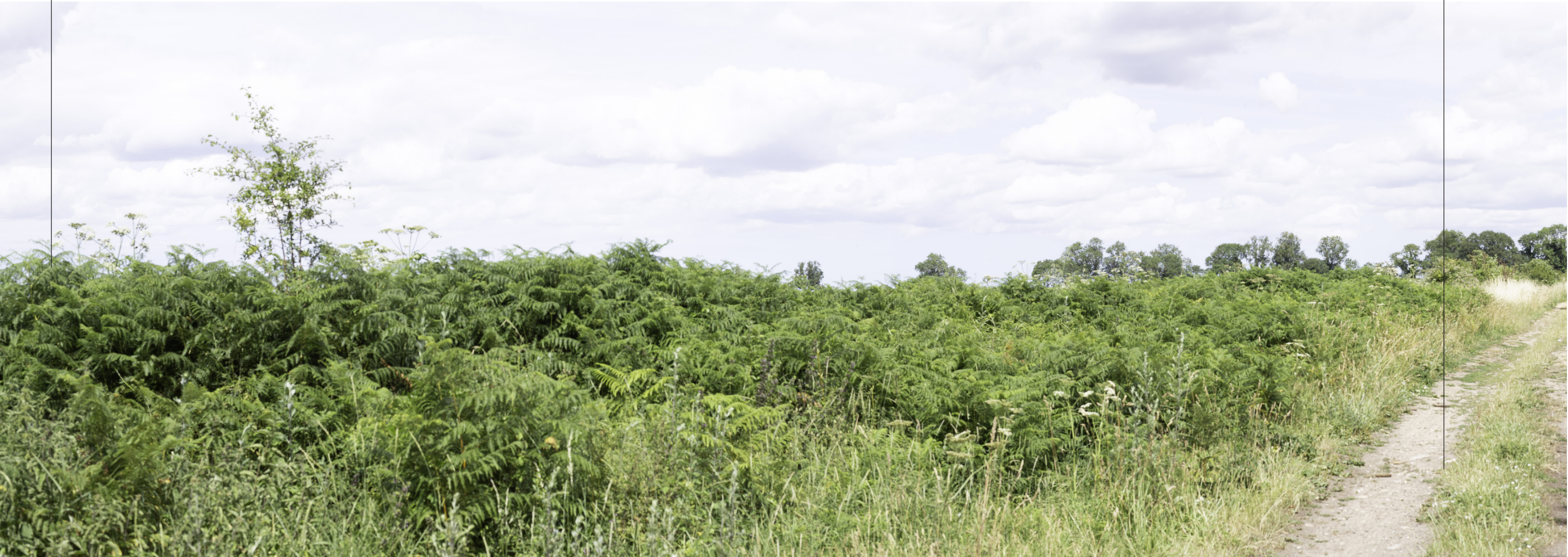
Representative Viewpoint 2 - Fincham Drove, Swaffham