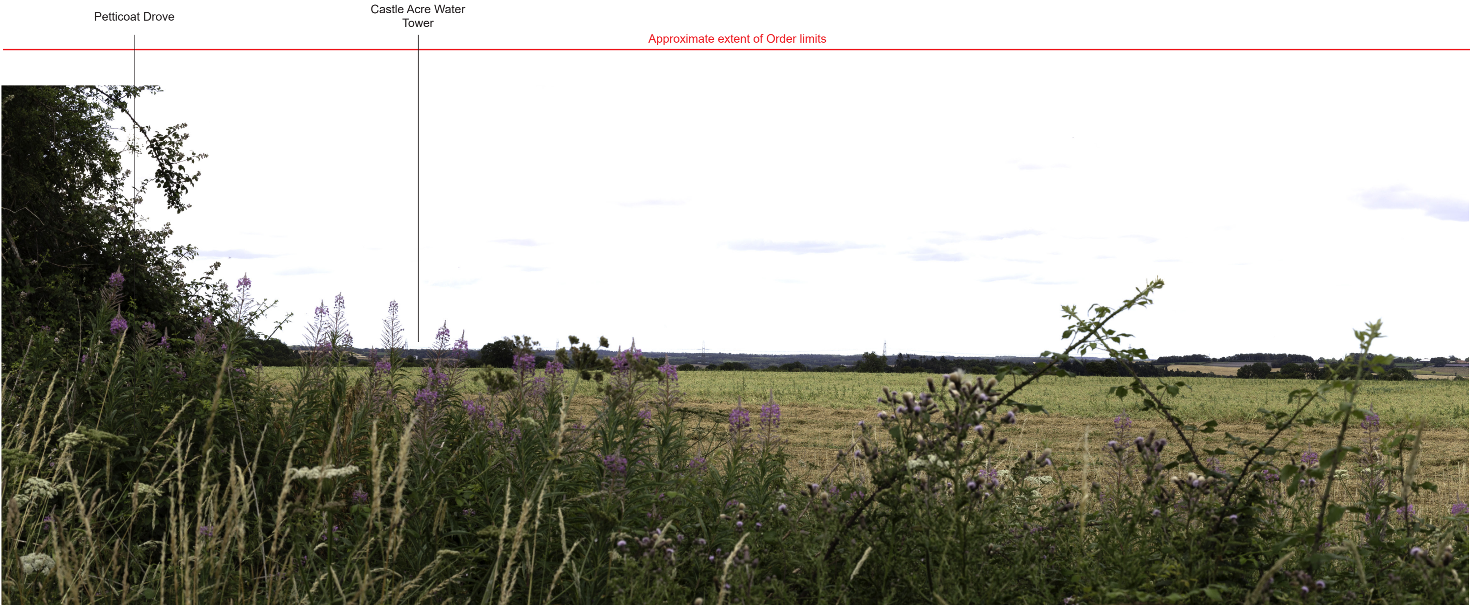
Representative Viewpoint 3 (looking east) - Petticoat Drove and PRow South Acre RB1