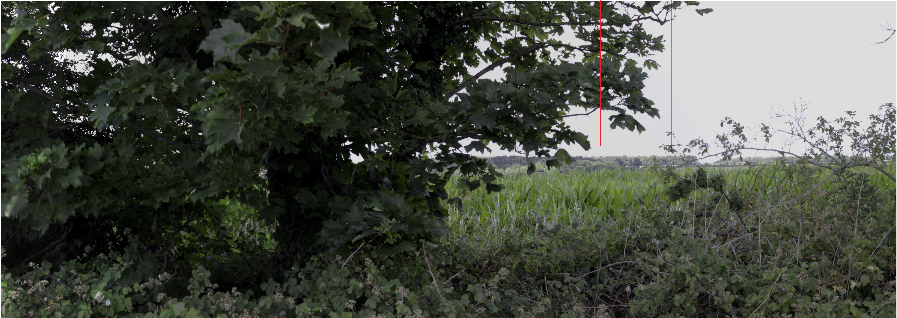
Representative Viewpoint 4 - PRoW Swaffham RB2