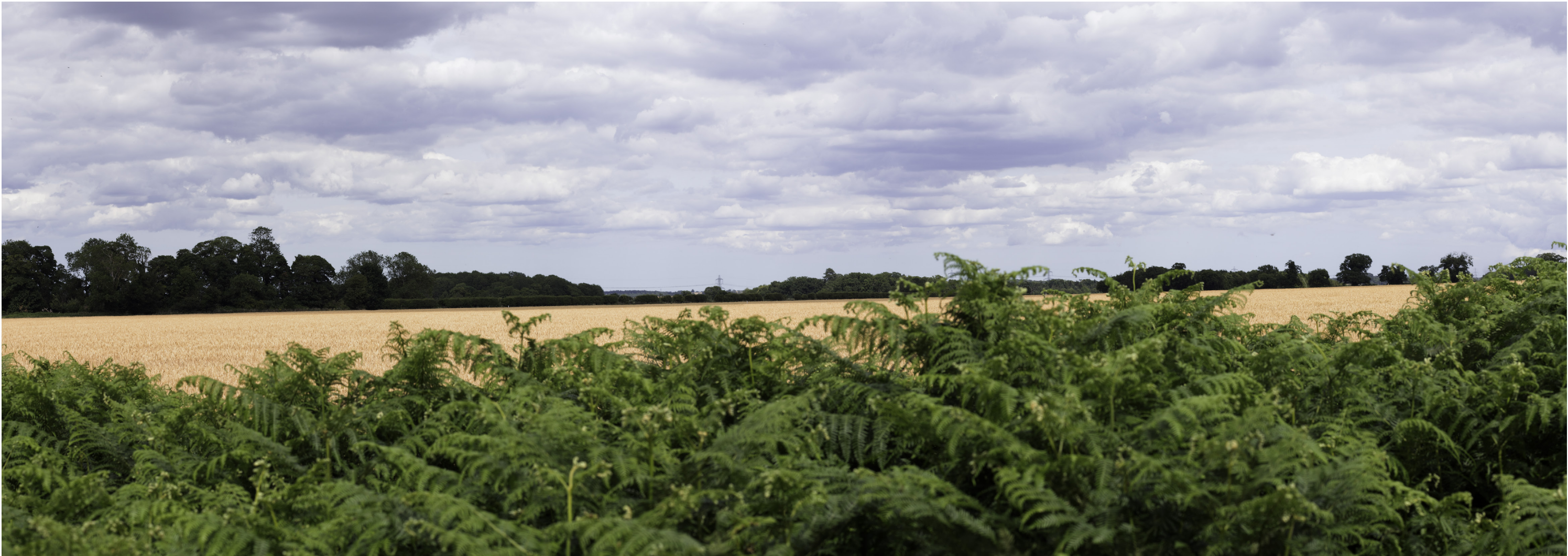
Representative Viewpoint 5 - River Road, Narford