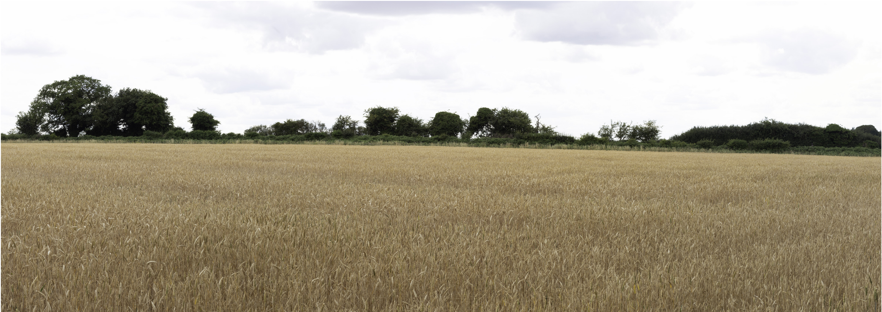
Representative Viewpoint 6 - PRoW South Acre RB2, South Acre

ISSUED BY Peterborough t: 01733 310471 DATE Nov 2025 DRAWN MSo SCALE@A3 NTS CHECKED OWh/MB STATUS Final APPROVED RP