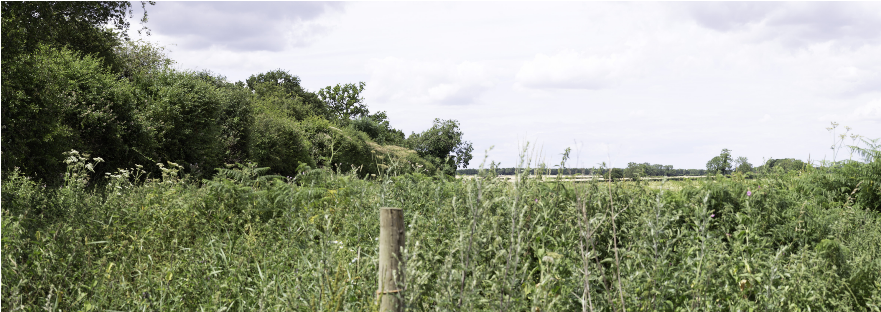
Representative Viewpoint 2 - Fincham Drove, Swaffham