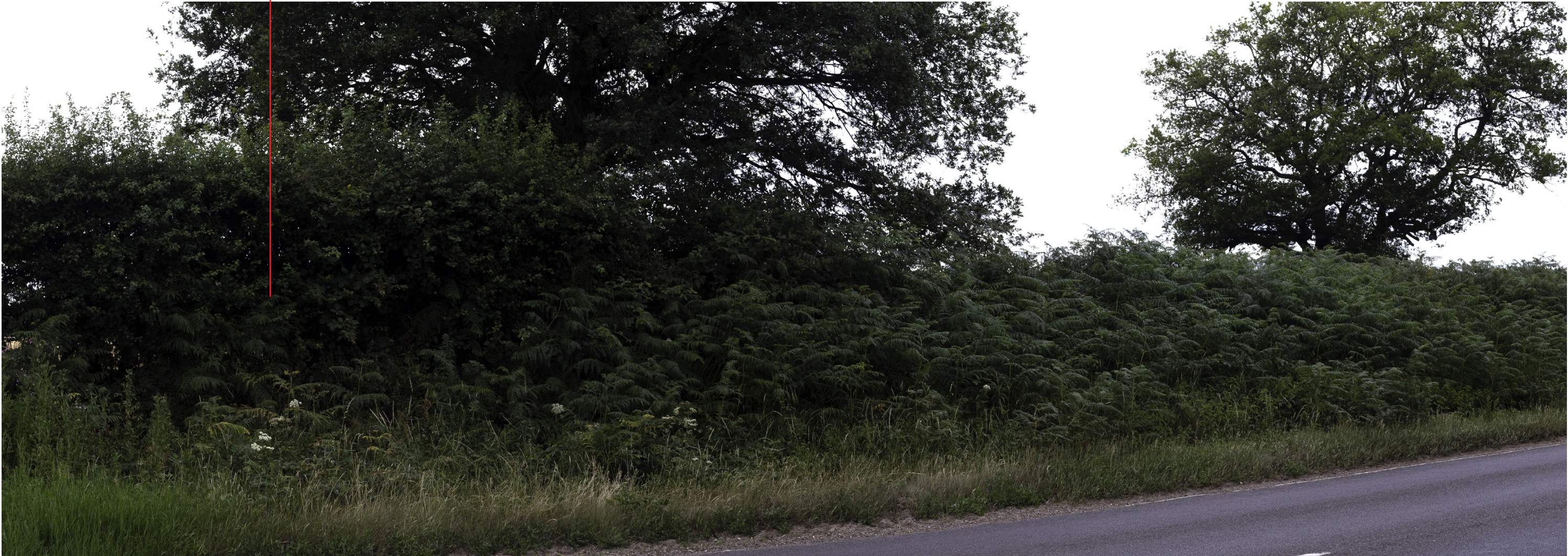
Representative Viewpoint 1 - PRoW Swaffham RB55 at A1065