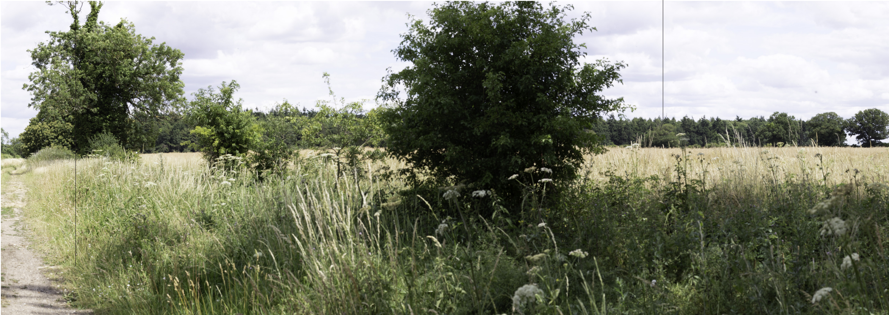
Representative Viewpoint 2 - Fincham Drove, Swaffham