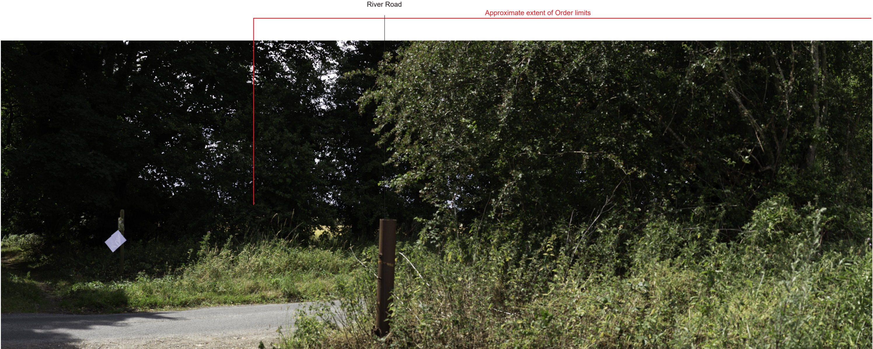
Representative Viewpoint 2 - Fincham Drove, Swaffham

Z:\9485_Kings_Lynn_Solar_Farm\6000s\LV\AES\Summer_Photo\panels\9485Fig6.11_PP_2.indd