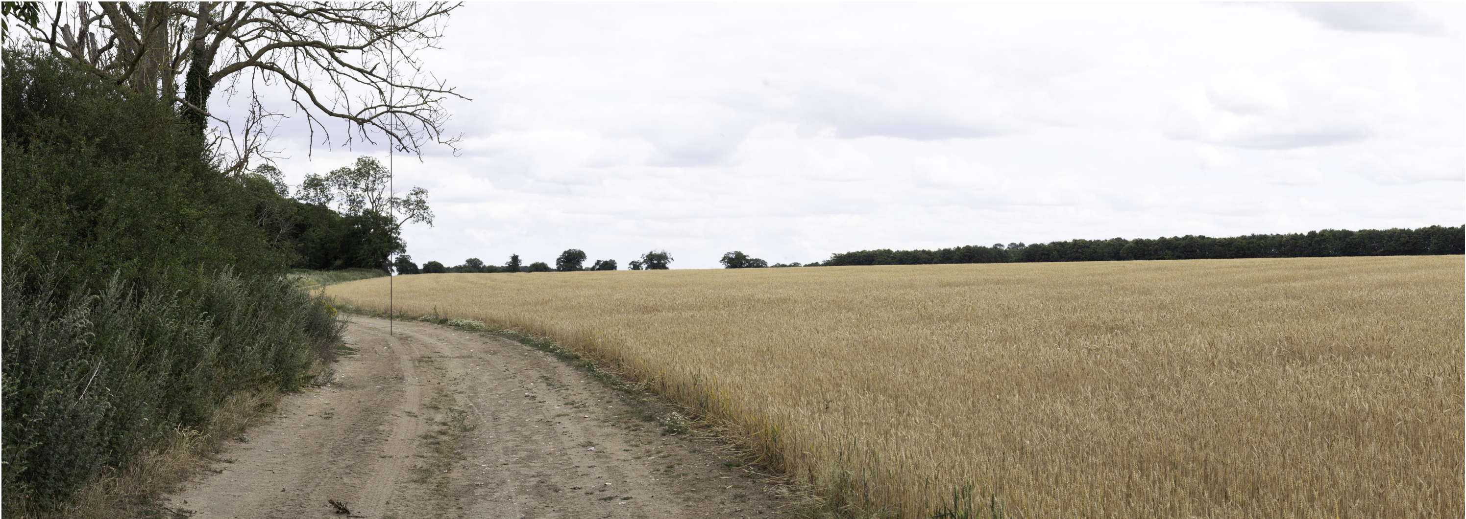
Representative Viewpoint 6 - PRoW South Acre RB2, South Acre