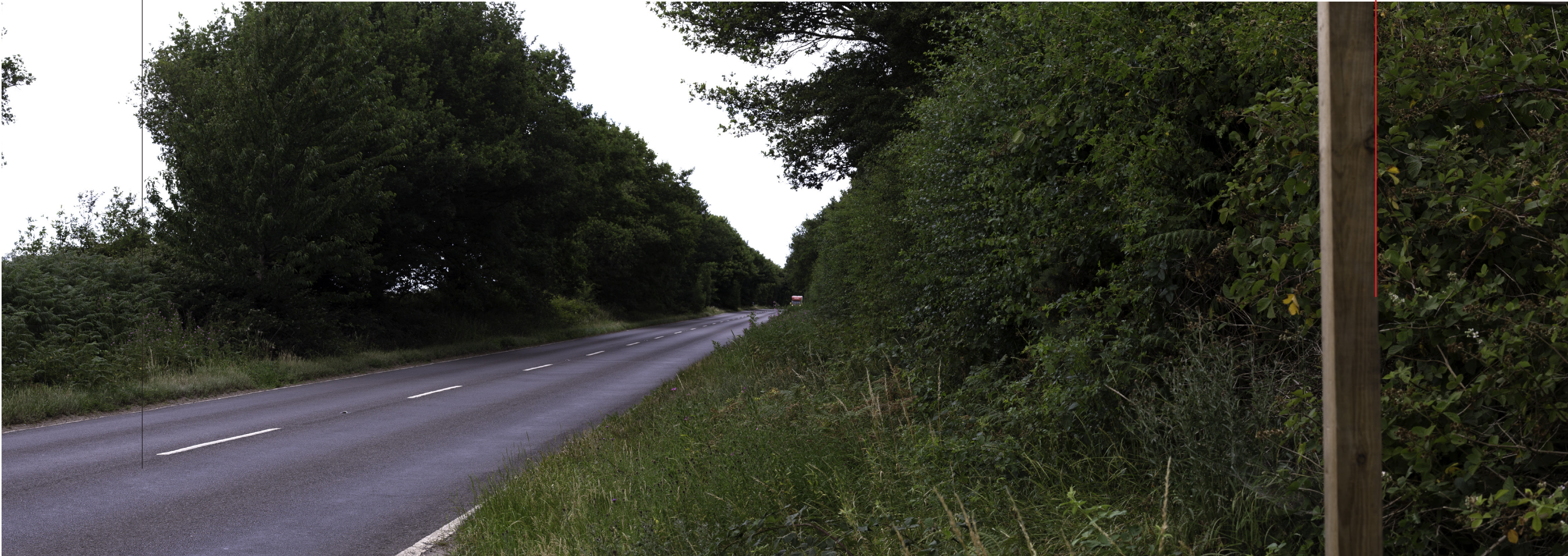
Representative Viewpoint 1 - PRoW Swaffham RB55 at A1065

Existing View - This view is representative of road users along the A1065 and PRoW users at the western end of PRoW Swaffham RB55. This viewpoint is located at the southern edge of the Site, with filtered views into the agricultural fields adjacent to the A1065. Existing hedgerow and mature hedgerow trees obscure mid to lower level views into the Site from passing traffic. Occasional gaps between trees allow intermittent glimpse views into the Site, beyond the existing vegetation.