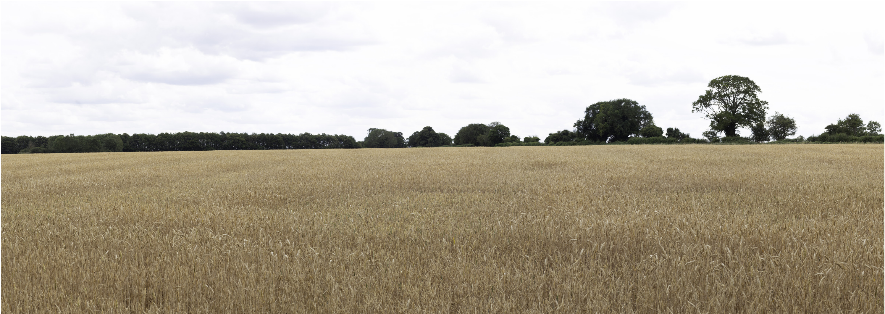
Representative Viewpoint 6 - PRoW South Acre RB2, South Acre