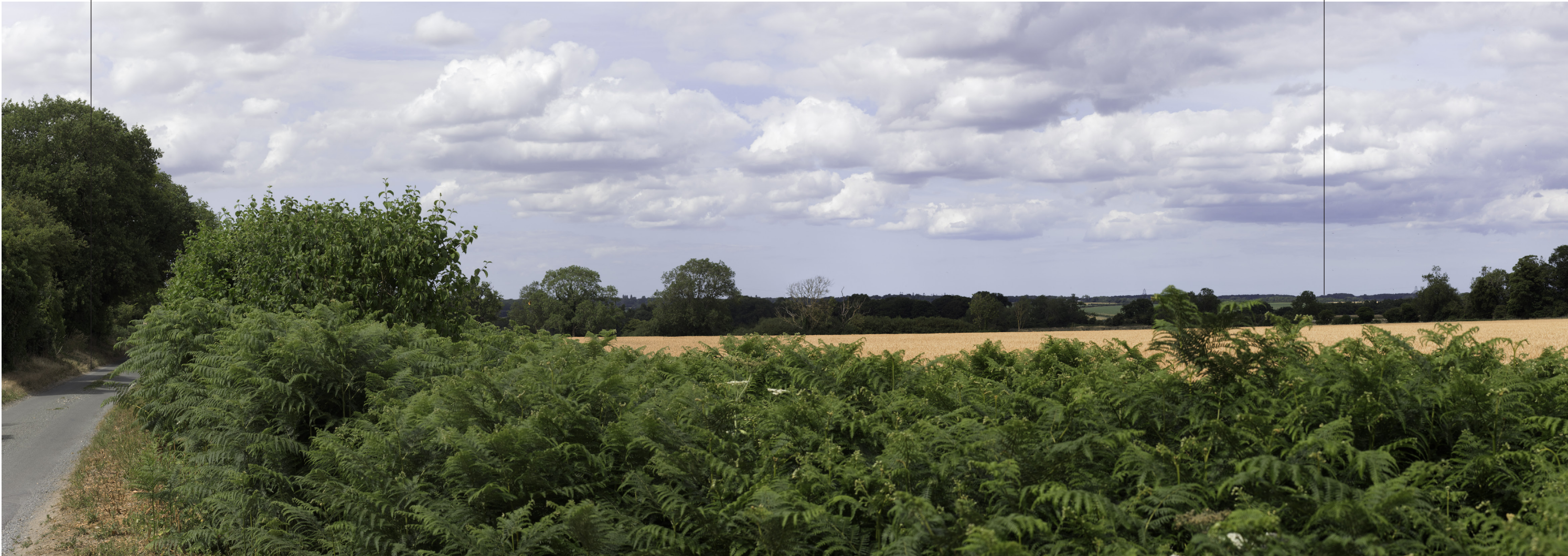
Representative Viewpoint 5 - River Road, Narford